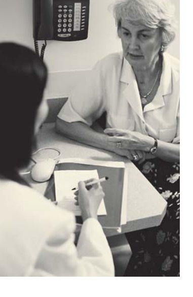
Before you travel, discuss your medicine schedule with your doctor or pharmacist.