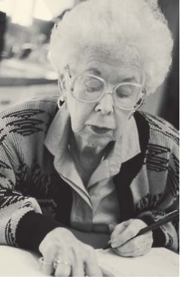
Keep an up-to-date list of all your medicines, prescription and over-the-counter.