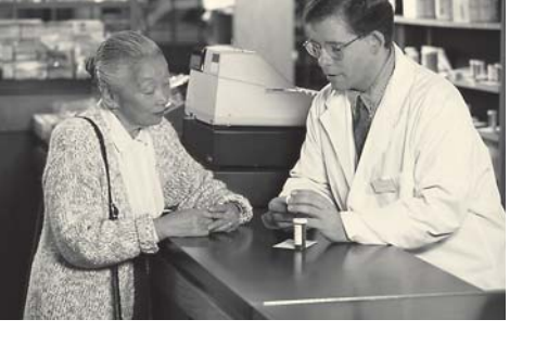
Your pharmacist can help keep track of your medicines.