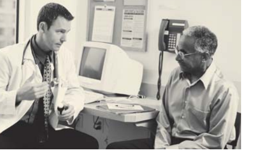
Tell your health professionals about your medical history and about all medicines or supplements you take.